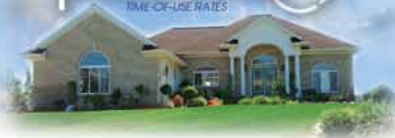
1500 kWh Comparison

Coast Electric's power switch TIME-OF-USE RATES